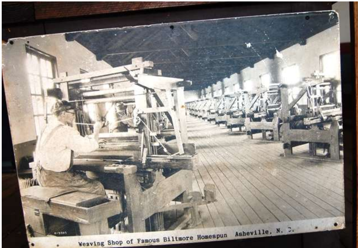
Weaving Shop of Famous Biltmore Homespun Asheville, N. C.

...learn about the early industries that sparked today's arts and crafts movement